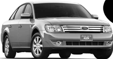
2008 FORD TAURUS