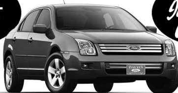
2008 FORD FUSION