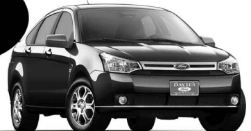
2008 FORD FOCUS